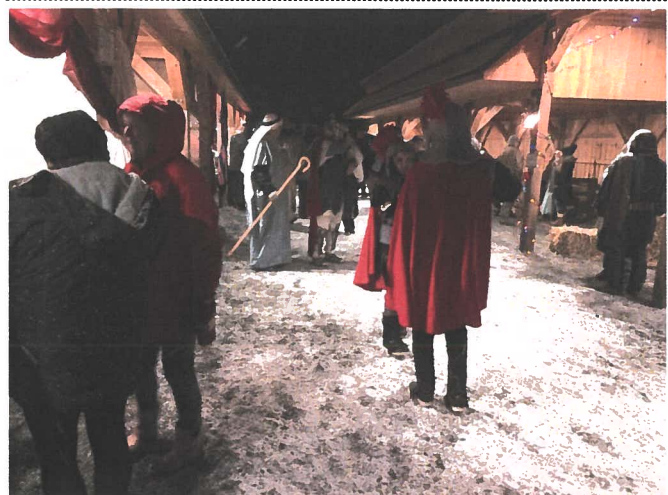
Snowy street scene from One Awesome Night 2018 includes shepherds, Roman soldiers, donkeys and Pugwash shoppers and visitors.