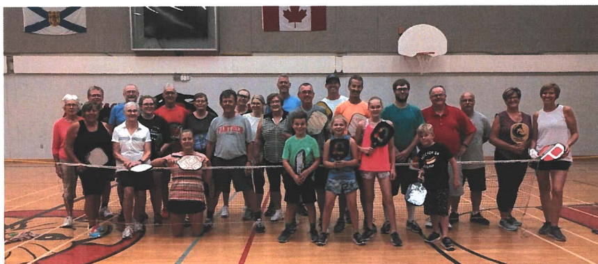
Some of the participants of the First Annual Pugwash Pickleball Tournament.

Pickleball continued through the fall and will probably continue through the winter, with 20-30 players, ages ranging from 7-82, playing at PDHS every Sunday and Tuesday evenings. The addition of pickleball lines to the outside courts now allow for extended play for all residents and cottagers of all ages.