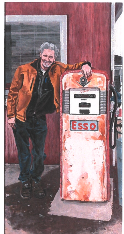
The Mechanic - acrylic by Louise Cloutier (location: Langilles Service Station)

Art in the Park would not be complete without a chance for the community to help create a new sculptural contribution to our village's cultural landscape. More information will be available soon.