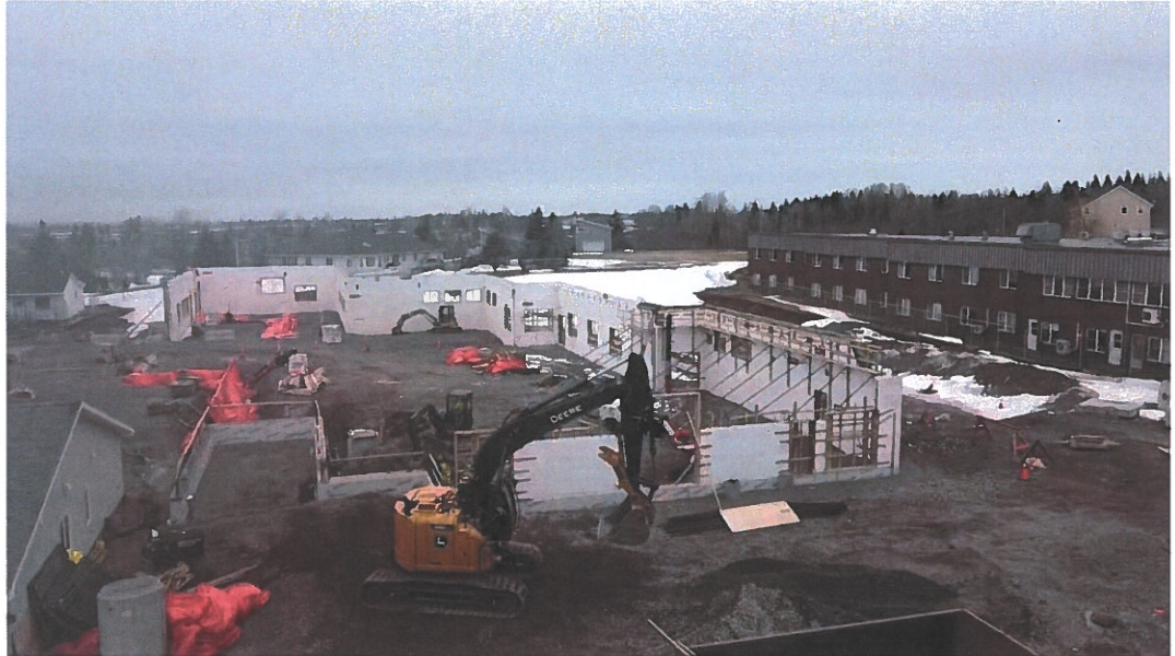
Aerial photo supplied by NSHA