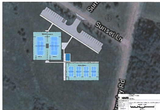
Sunset Park. Design by The Tennis Design Studio

To pay by cheque: make cheque payable to 'The Sunset Community' and include a note that the donation is for the Tennis and Pickleball project. Send your cheque to the Sunset Community, 140 Sunset Lane, Pugwash, NS, B0K 1L0. To pay by e-