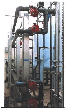
Water treatment system

The final pieces of equipment, at the chlorine analyzer/booster station, will be operational starting the week of September 24th. Once this equipment is working fully the municipality will be in a position to supply water to customers.