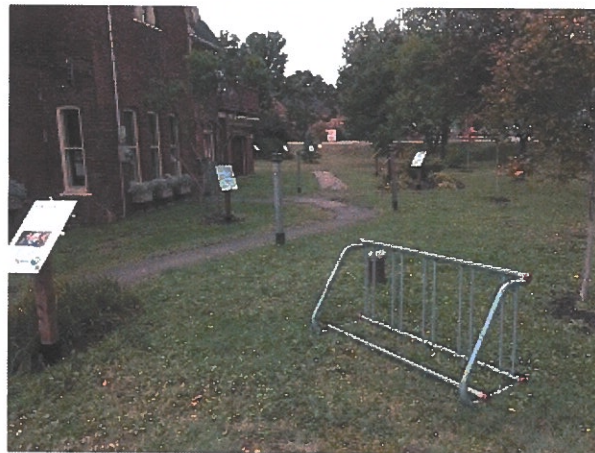
Much of the Story Walk can be seen at the front of the train station. In the foreground is one of two bicycle racks recently purchased by Communities in Bloom.

We are proud to partner with the Pugwash Farmers' Market by refinishing and painting two existing picnic tables. One is painted with the Progressive Pride Flag. The second displays the Mi'kmaq Grand Council Flag. We have enjoyed seeing market photos of many people using these tables.