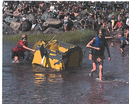
Sinkers' Conference. Photo supplied.

After pandemic restrictions we were all so very hopeful that the summer of '22 was going to be back to normal and it was!