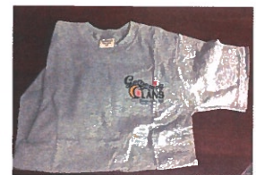
Gathering of the Clans shirt $20