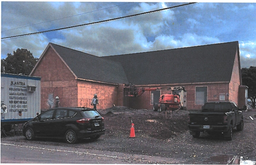
Construction progress as of 20th September 2022.

Work on $2.198-million facility is continuing near the intersection of Highway 6 and Durham Street and should be completed by the end of October with the library opening in early 2023. The 3,700-square-foot library is being built by Iron Maple Constructors and will replace the library in that has called the village's former train station home since 1988.