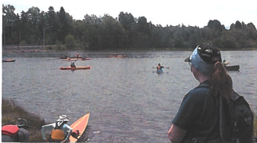
FOPE Flotilla, July 2022. Photo supplied

FOPE Started July with a float in the Canada Day Parade and manned a booth for the Gathering of the Clans.