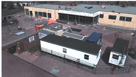
Aerial photo supplied by NSH

Progress continued on the construction of the new North Cumberland Health Care Centre throughout the summer with the installation of the electrical and mechanical systems and the building's windows. Final connections have been completed to the geothermal piping on the inside of the building. Interior partitions to frame the rooms are now being built. Some masonry work is underway as well as construction of the retaining wall.