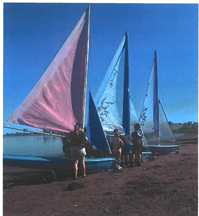
Sailing school students on Crescent Beach, Pugwash. Photo supplied