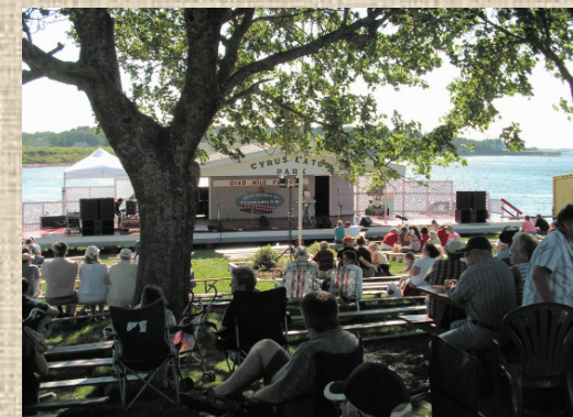
Entertainment In Eaton Park