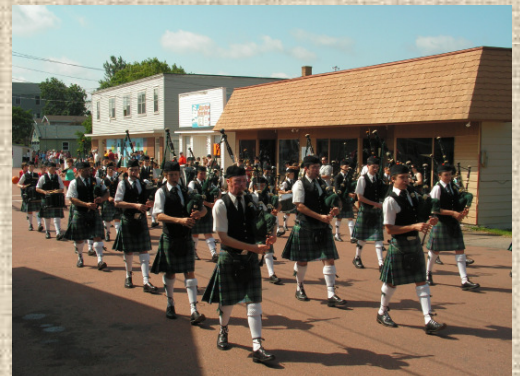
Pipes & Drums