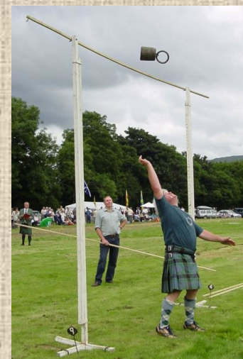
Heavy Weights Competition