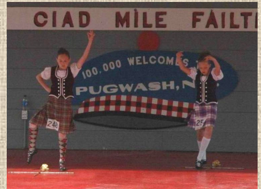
Highland Dance Competition

To Register for the Highland Dance Competitions and Piping & Drumming Competitions: Contact the Gathering of the Clans Festival Coordinator: Telephone: 902-243-2946 or email: villagecommission@pugwashvillage.com