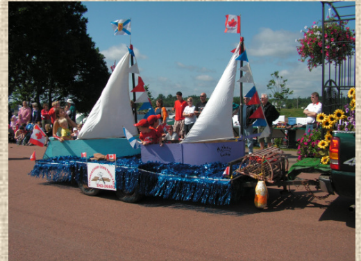
The Grande Parade

Over the years, the festival has evolved to include Heavyweight Competitions, Lobster Dinners, Midway, Crafts, Musical Entertainment, Street Entertainment, Parades and a spectacular Fireworks display at dusk.