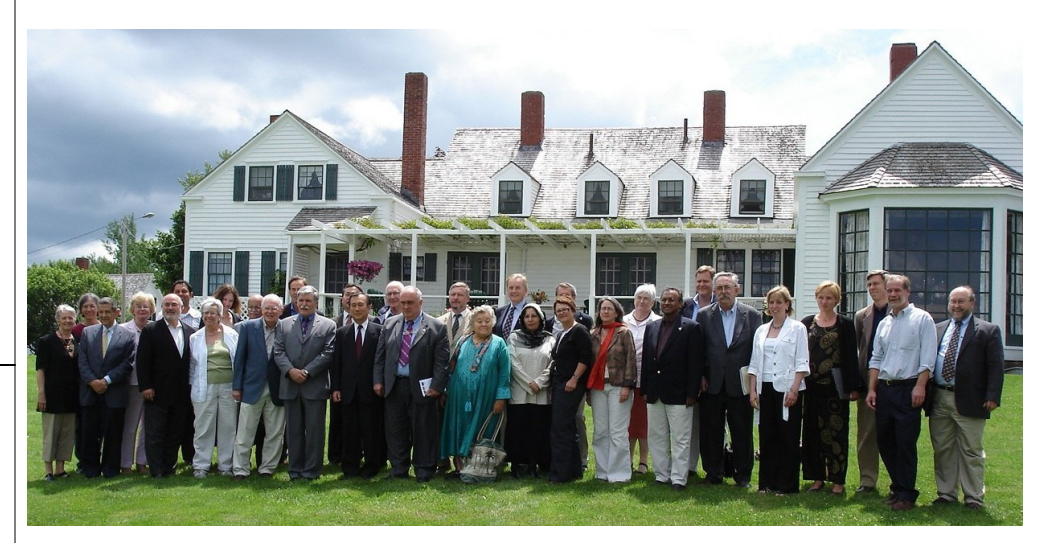
"Participants, observers and special guests of the recent conference celebrating the 50th Anniversary of the Pugwash Conferences."

July was an amazing month for the Pugwash Peace Exchange and for the community of Pugwash. In celebration of the 50th anniversary of the Pugwash Conferences on Science and World Affairs, we hosted a conference with almost 30 of the world's foremost nuclear disarmament experts. Our roster of guests included the President of the Pugwash Conferences, M.S. Swaminathan; the President of Mayors for Peace and the Mayor of Hiroshima, Tadatoshi Akiba; the former UN Under-Secretary for Disarmament, Jayantha Dhanapala; Nova Scotia Premier Rodney MacDonald; the former Minister of Foreign Affairs and current Minister of Defence, Peter MacKay - just to name a few. Our open forum on July 5th and our Dinner of Peace on July 7th were very well-attended by the local community, with many expressing delight at the opportunity to meet and speak with the various delegates. The result of the conference will be a document that provides a global roadmap towards nuclear disarmament, and will be presented to all world governments. For a look at statement from the conference, preliminary please www.pugwashpeaceexchange.org