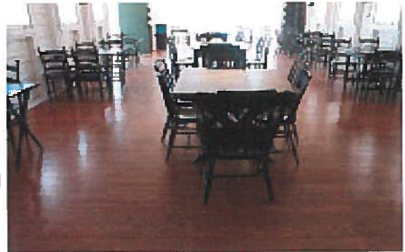
Freshly renovated Eaton Dining Hall (photo submitted)

The renovations and landscaping are complete, making the venue available again to use for suppers, receptions and private functions. To book the Dining Hall call 902 243 2071 or email thinkerslodgepo@gmail.com